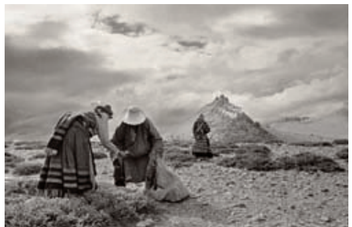
Peter Bialobrzkeski, Summarit-S 35 mm f/2.5 Asph (page 8) The Noctilux-M 50 mm f/0.95 Asph (page 24) Pierre Crié: Tibetan pilgrimage (page 48)