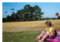
Helicopter formation on 'All American Day', Fort Bragg, North Carolina, 2006