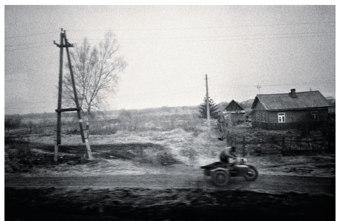
Thurston Hopkins: Joan Crawford in London, 1956 (p. 6) Photo hard disks: Secure and view digital pictures (p. 34) Gert Jochems: On the Trans-Siberian Railway (p. 56)