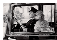
Cover photo: Thurston Hopkins, La Dolce Vita, 1953