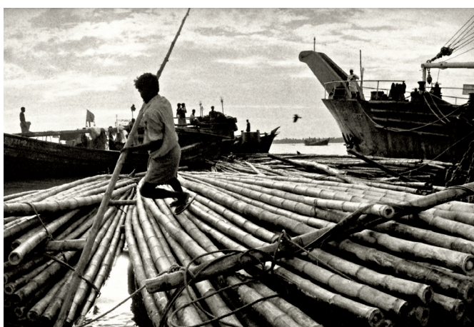
Emin Kadi: in South Africa (page 10)