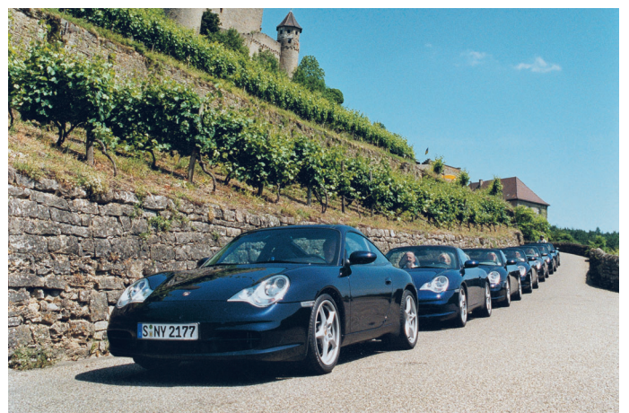
Henri Cartier-Bresson, (above) Only one person takes photographs with the M7 Titanium (middle) Porsches in convoy, (below)