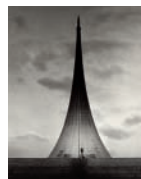
Sputnik Memorial, Moscow, 1996