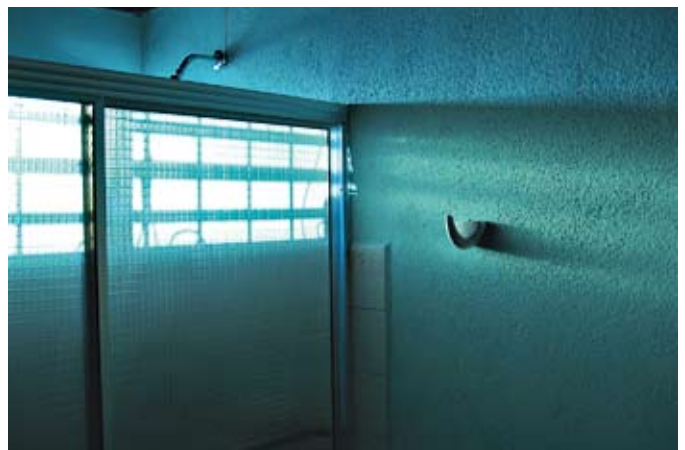
Susan S. Bank: from 'Cuba: Campo adentro', 2008 (page 54) Robert Grischek photographed with Leica's S System (page 20) Jessica Backhaus: from 'One day in November', 2008 (page 6)